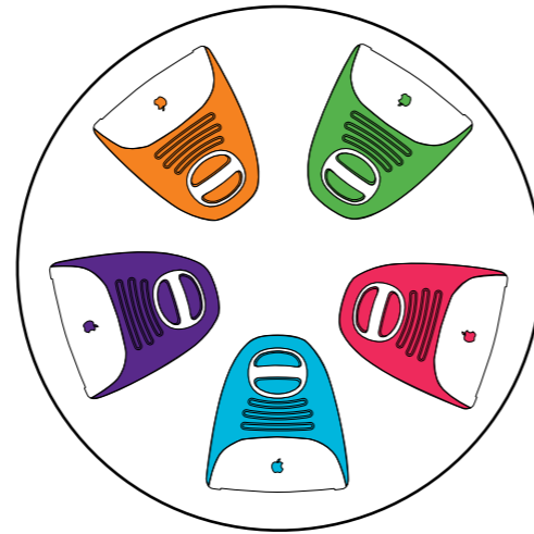
Flower configuration top view